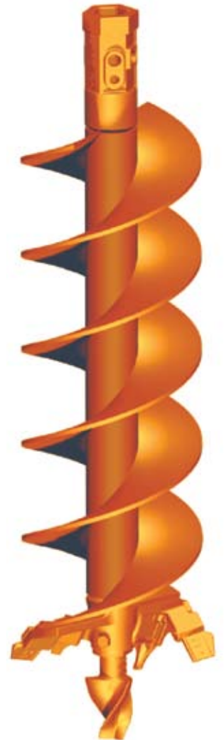
Double Flight TriMax® Auger